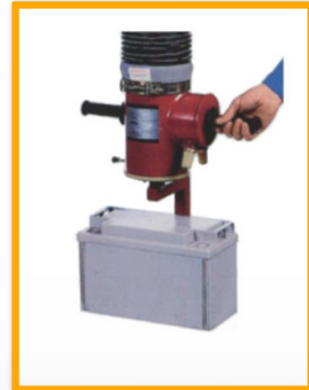
Offset sucker for handling products sideways 30 kg load