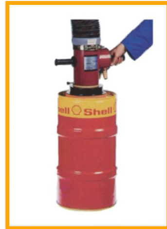
Cask sucker 250 kg load