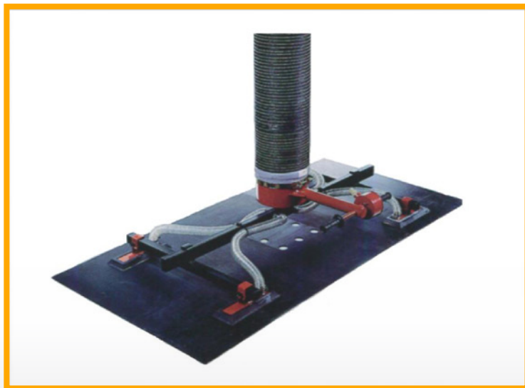
Extended control handle, spreader fitted with 4 adjustable suckers for handling panels, sheet metal, etc. 120 kg load

INCREASE PRODUCTIVITY AND DECREASE RISKS