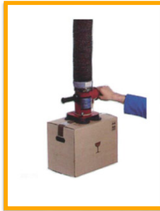
Cardboard sucker with bellows 30 kg load