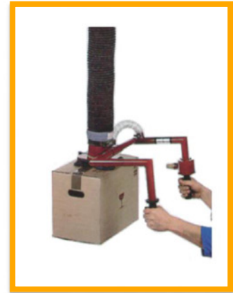
Extended jointed handlebar-shaped control handle; Cardboard sucker with bellows 30 kg load