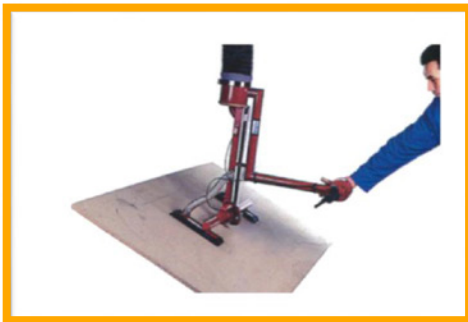
Panel tilter Extended control handle. Spreader fitted with 2 adjustable suckers. In the process of tipping 50 kg load