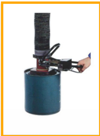
Cask sucker with a trigger handle 30 kg load