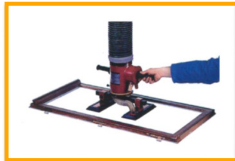
Double-coupler sucker for handling Glass plates 50 kg load