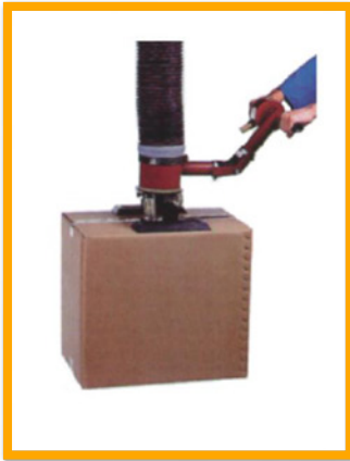
Extended jointed control handle; Two-coupler cardboard sucker 50 kg load