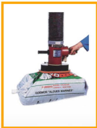
Plastic bag sucker 50 kg load