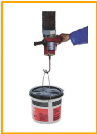
Hook grip 30 kg load