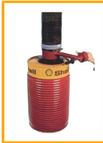
Cask sucker 50 kg load