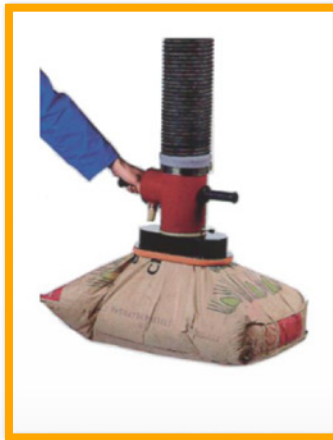
Paper bag sucker 50 kg load